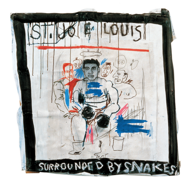
St. Joe Louis Surrounded by Snakes, 1981