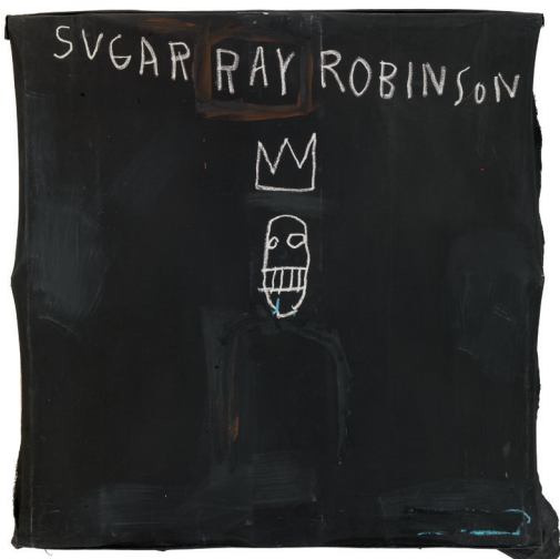
Untitled (Sugar Ray Robinson), 1982

Sugar Ray Robinson was an American professional boxer who competed from 1940 to 1965. He is considered by many to have been the best fighter in history and a man whose every move in and out of the ring showed what Black pride and power meant.