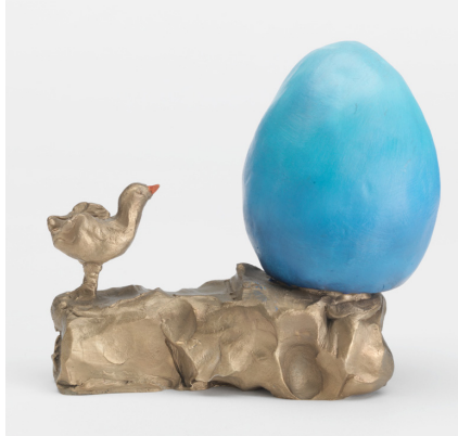
Small Bird, Big Egg, 2011