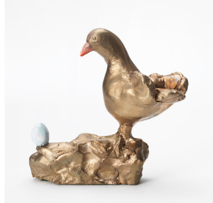
Small Egg, Big Bird, 2011

URS FISCHER mines the potential of materials—from clay, steel, and paint to bread, dirt, and produce—to create works that disorient and bewilder. Through scale distortions, illusion, and the juxtaposition of common objects, his sculptures, paintings, photographs, and large-scale installations explore themes of perception and representation while maintaining a witty irreverence and mordant humor. 2